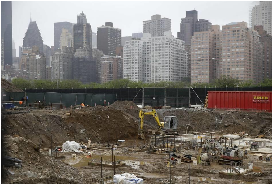
Construction on the Cornell Tech campus on Roosevelt Island in June.

Projects by schools, hospitals and others more than tripled in the first half of this year compared with a year earlier